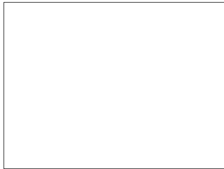
Children of alumni learning how to draw