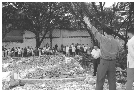
A month before construction started, faculty and staff members together with the students prayed at the construction site on November 8, 2005.

These photographs show the rapid progress being done in the construction site. Do pray for the safety of all workers and for the funds needed to see this project to completion. Please contact the business office by phone, by email, or even visit us and witness the work of the Lord being accomplished through human hands!