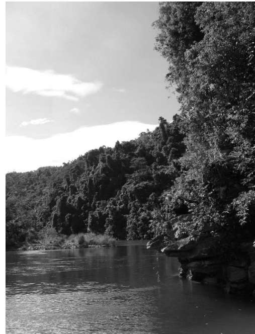
Scenic place in Mindoro.